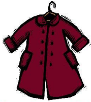
Warm Clothing Drive

We are still collecting warm clothing, twin sheets and paper goods, along with toiletries (soaps, shampoo, tooth brushes/paste, etc.). Please put clean items in the green & red box in the church entryway. Thank you for your wonderful support. We really are Mission on Our Doorstep, helping others in our community.